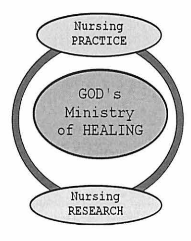
Figure 2. Nursing in the context of the Bible