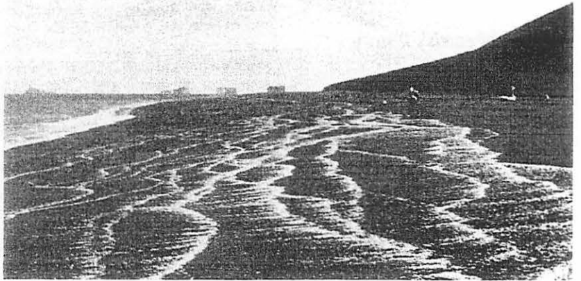
Figure 2. The new island of Surtsey. Note the beach, the cliff, and men for scale. The small white objects on the beach in the foreground are krill, planktonic crustaceans that constitute food for whales. The rock stacks in the distant horizon are not part of the island. Five months and two days earlier, this area was open ocean.