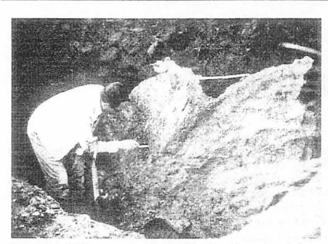
The author (left) uncovering the fossilized cranium of a whale.

find it necessary to reconstruct the represented organism in order to interpret the fossil, comparing it to present organisms and/or similar fossils. This task is subject to the presuppositions and the imagination of the one who performs the reconstruction, therefore cannot be totally objective or reliable.<sup>10</sup>